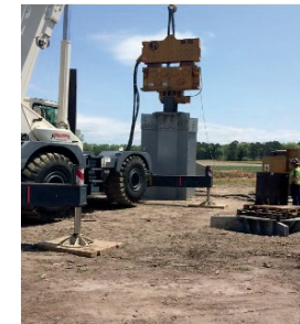
Hanging Vibratory Hammer - Crane

The appropriate equipment for the project will be determined by the specific site conditions, soil conditions, and site access.