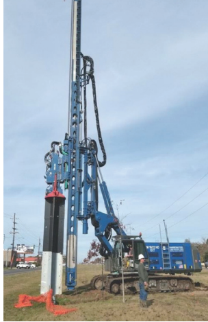
Louisiana Department of Transportation Federally funded project Installed Eight (8) Friction Piles over eight (8) miles for Monopoles standing 65' - 110' tall