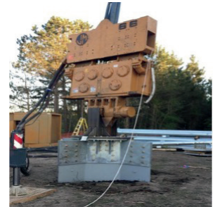
Hanging Vibratory Hammer - Excavator